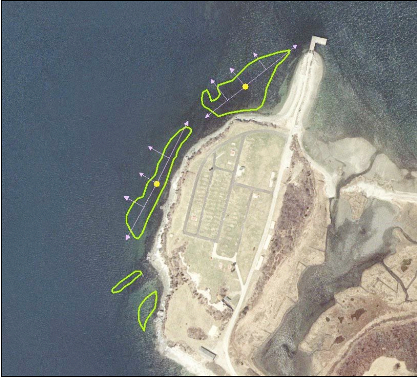
Figure 2. The basic strategy for groundtruthing eelgrass delineations is to collect video and GPS data at the middle and edges of the polygon (intersections of the arrows and the green line).