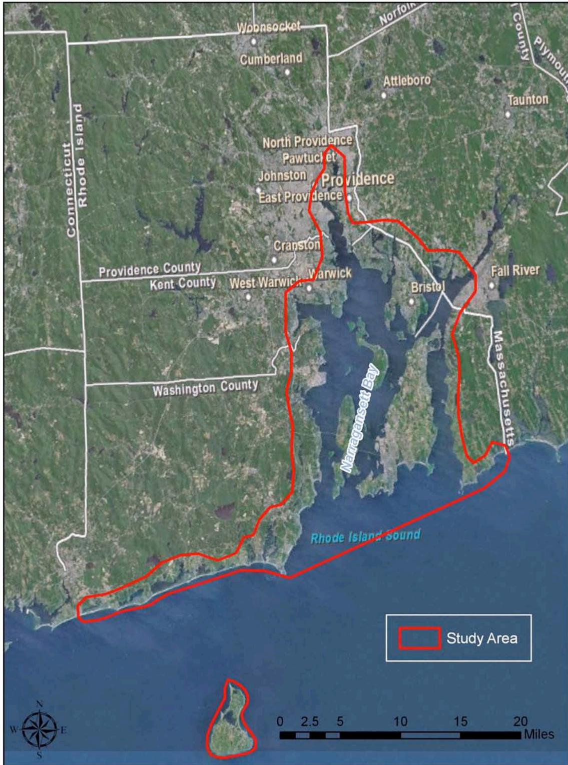
Figure 1. Extent of the proposed eelgrass mapping area that includes Narragansett Bay (and Mount Hope Bay), the coastal ponds, and Block Island.