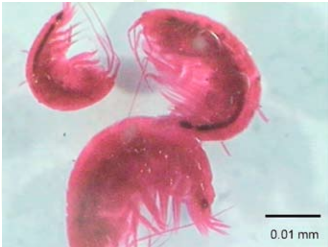
Above: Shrimp-like amphipods ( Ampelisca spp.)

In 2010, the Narragansett Bay National Estuarine Research Reserve started a long-term study of benthic infauna around Prudence Island. The goal of this program is to understand which species make up the benthic infauna communities in the sediments around the Island, and learn about how they are changing over time. The study sites are located at the same places where the Reserve is monitoring water quality as part of our national System Wide Monitoring Program (SWMP). This study is the first step in a process to study changes in benthic species of the Reserve over time.