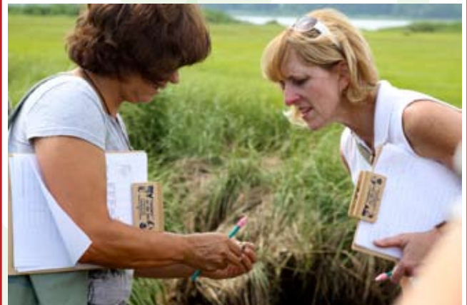
Above and Below: Teachers exploring Narragansett Bay on-site and on-line