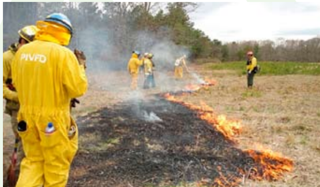
Above: Wildland firefighters at work on the South End

On April 30 and May 1 of this year, the Narragansett Bay Research Reserve held controlled burns on the south end of Prudence Island. Also known as prescribed fires, these burns restore and preserve fire-adapted natural communities and safely reduce fuel loads in the forest. Fires are natural processes and yet a policy of fire suppression in natural areas was implemented across the United States for much of the 20 th century. Historically, fires swept over the landscape and were only stopped by rain or snow, natural breaks, and less fire-prone ecosystems like wetlands. This led to a wonderful patchwork of habitat types with a high biological diversity of plants and animals. Within our pine barrens on Prudence Island, the frequency, location, and timing of prescribed fires can be staggered to imitate natural fire events on a more modest scale in order to maintain a similar biodiverse mosaic.