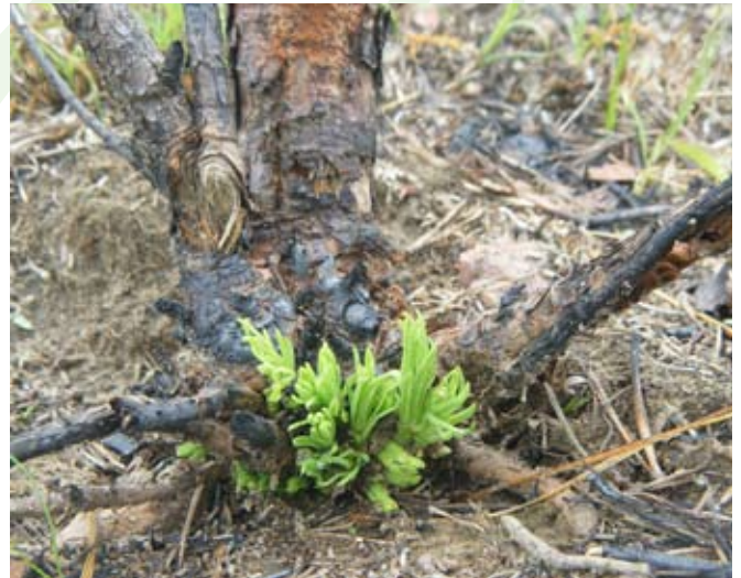
Above: Rapid regrowth after the prescribed fire

evolved within these fire-dependent habitats and thus indirectly rely on fire for their survival. On Prudence Island, these include songbirds such as the pine and chestnut-sided warblers ( Dendroica spp. ), and several rare moths and beetles.