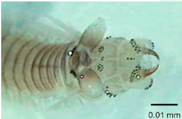
Above: A bottom-dwelling segmented polychaete worm