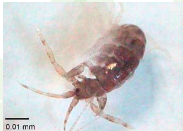
Above: One of many microscopic amphipod crustaceans living in the bottom of the Bay

Generally, mud-bound benthic animals are not free-moving and cannot swim away to avoid polluted conditions or low oxygen levels in the water or bottom sediments of the Bay. They are also year-round Bay residents, diverse, abundant, and largely left alone by people. These factors make the critters an excellent indicator of the health of the Bay. If certain infauna species are thriving while others are dying from environmental changes, then the whole benthic