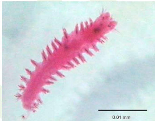
Above: A segmented polychaete worm ( Nereis spp.)

So how do Reserve scientists find, identify and record these bottom-dwelling life forms? Sampling takes place four times each year – once per season. Staff members go out on the Bay in a small boat with a device that grabs a sample of the bay bottom and containers for each sample. Each sediment sample is fixed with formalin (a preservative) and the whole thing is stained with a pink dye known as Rose Bengal. This turns the benthic infauna bright pink and makes them much easier to find under a microscope. In the winter samples of 2010, researchers found various species of polychaete worms, nematodes, and amphipods. Reserve scientists take digital photographs of the different organisms to build a photo library that will be a useful tool for educators and researchers.